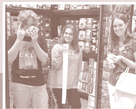
Local teens working with LCCC's Substance Abuse Prevention Coordinator to implement Project Sticker Shock at local alcohol retail establishments.