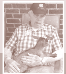
Enjoying a special visit from a petting zoo at BOGADS.