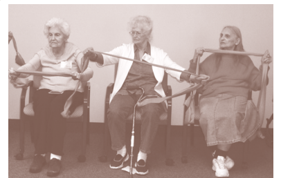
Guests having fun exercising!