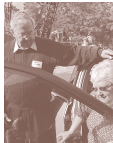
Volunteers learn how to use safety items.

Other generous grant funds were received from the Diocesan Services Appeal, DTE Energy Foundation, Catholic Campaign for Human Development, Robert W. & Maxine C. Parker Foundation and First Presbyterian Church of Brighton.