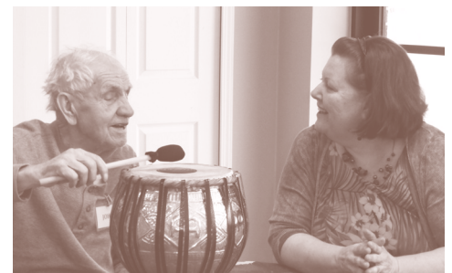
Music Therapy at Be Our Guest

A supportive and caring environment for memory impaired adults who would benefit from a structured day setting. Our goal is to provide meaningful services that enrich the lives of older adults, families and caregivers. Payment is made on a cost-share basis.